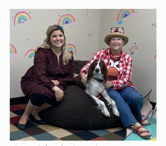
GW School introduces a new addition to their faculty. Meet Pink, a loveable therapy dog who is bringing joy and comfort to the students. A huge thank you to Pink-the pawfect helper for GW students!